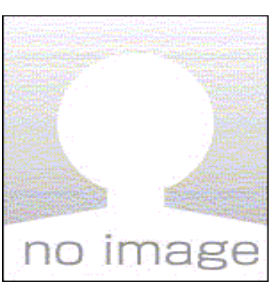
Offense Code CA52769594