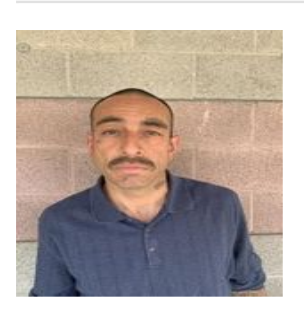
Charge/Offense Lewd or lascivious acts with a child 14 or 15 years of age and offender 10 or more years older than victim.